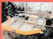
TRI 8 Ft Bush Hog