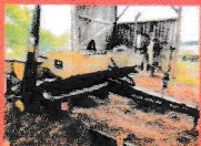
JD 7200 4 Row Corn Planter