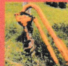
Post Hole Auger