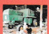
6600 JD Combine