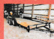
18 Ft Gator Trailer