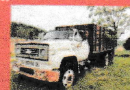
76 Chevy with Dump

JD 2840 Tractor Knoedler Feed Cart Silage Wagon Henke Feed Trailer