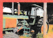
4430 JD Tractor