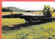
Drop Deck Trailer