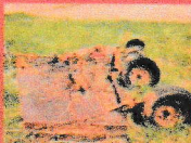
Batwing Bush Hog